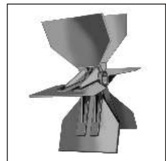
RADIAL (PADDLE TYPE)