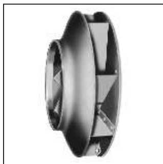
BACKWARD INCLINED BLADES